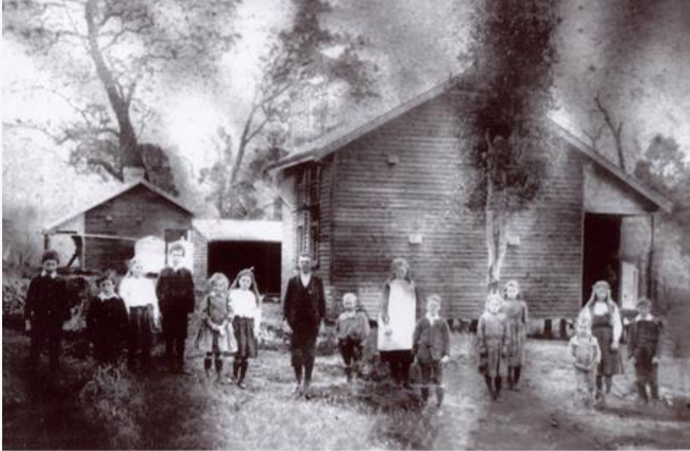
Above: Upper Capel School, c. 1910

House No. 680 was once the Ludlow Public School Head Teacher's quarters.