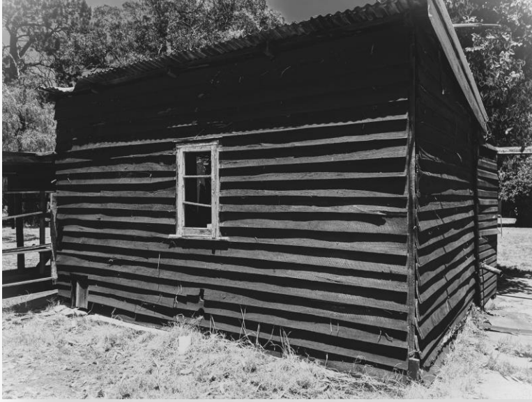
Above: Ludlow School Quarters (House 680) Wash-house, 2023