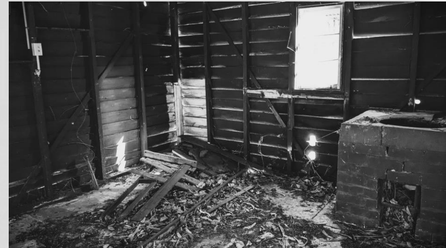
Above: Ludlow School Quarters (House 680) internal view of wash-house, 2023

Left: As observed in 2023 the wash-house which still stands, appears to have contained a bathroom as well. A separate toilet to the end of the wash-house is modern. In the back wall there is a small hinged flap for removing a toilet pan, indicating that a wooden pan-type toilet once stood there.