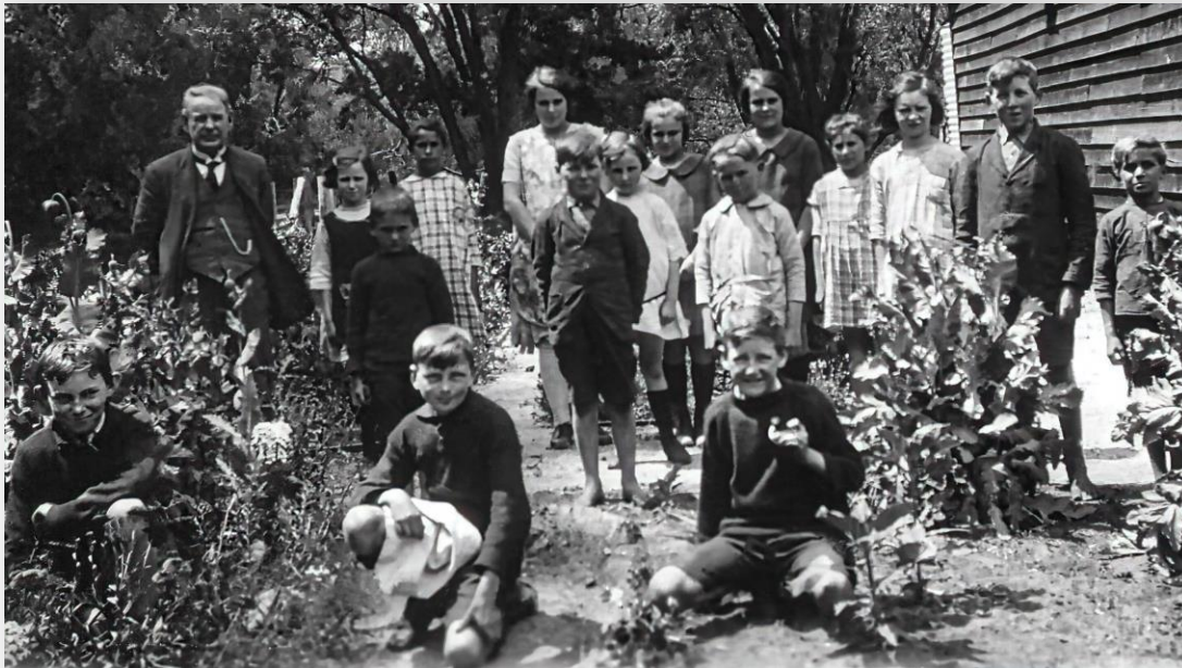
Above: Head Teacher with pupils beside Ludlow School c. 1926.