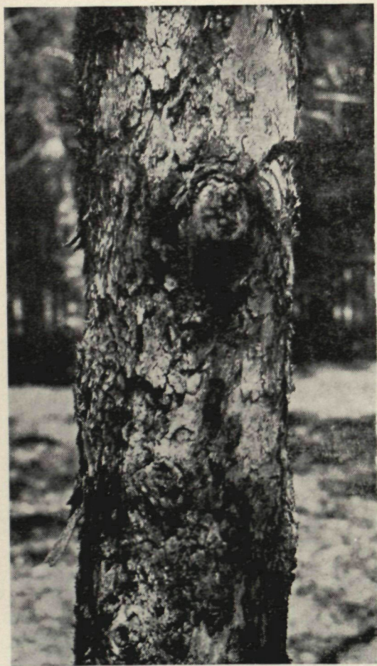
Close-up of the trunk of the Illyarrie, showing white bark partly covered by patches of older bark.

The species remained in obscurity, however, until in recent years it was found in some abundance at Bookara Siding not far from Dongara. Today it is found in many parks and gardens both in the city and in the country, and it is successfully cultivated abroad.