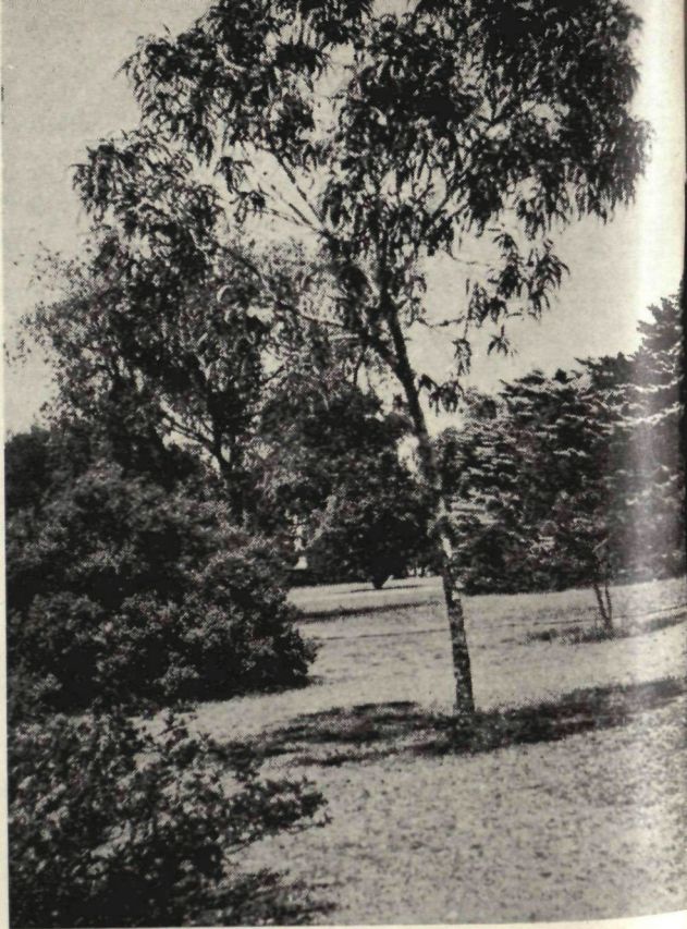
ILLYARRIE.—This specimen is growing near the entrance to King's Park, Perth