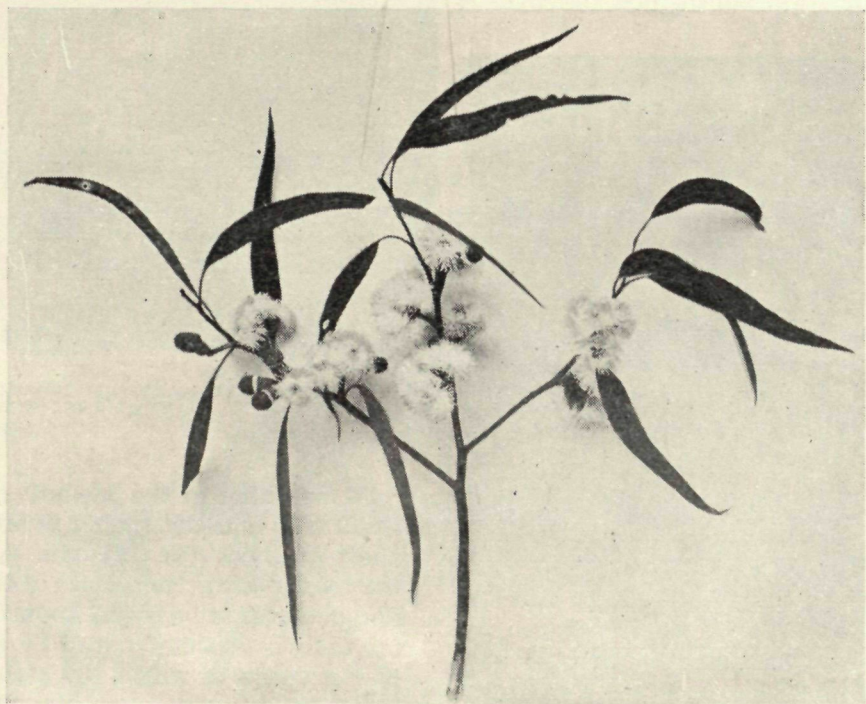
Tuart flowers and leaves. Note operculum being pushed off on lower left-hand spray, prior to opening of the blossom.

tube bell-shaped, the operculum hemispherical to ovoid-hemispherical much broader than the calyx-tube. Stamens with yellowish-white filaments inflected in the bud, the anthers versatile (centrally attached), oblong, opening in longitudinal parallel slits. Fruits stalkless, bell-shaped, smooth or with one faint rib, three-quarters of an inch long, the disc slightly raised, narrow, the capsule deeply included in the fruiting calyx-tube with broad triangular truncate valves almost level with the orifice of the fruit.